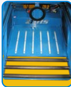
Roller / Slide Strip Combination